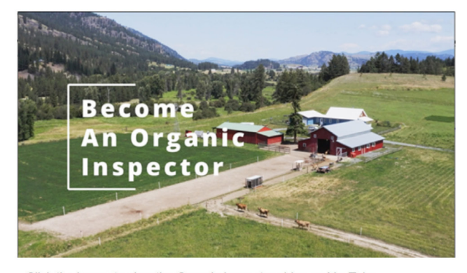
Click the image to view the Organic Inspector video on YouTube.

This video was developed by the organic community, led by Oregon Tilth and International Organic Inspectors Association, under the NOP Human Capital Initiative.