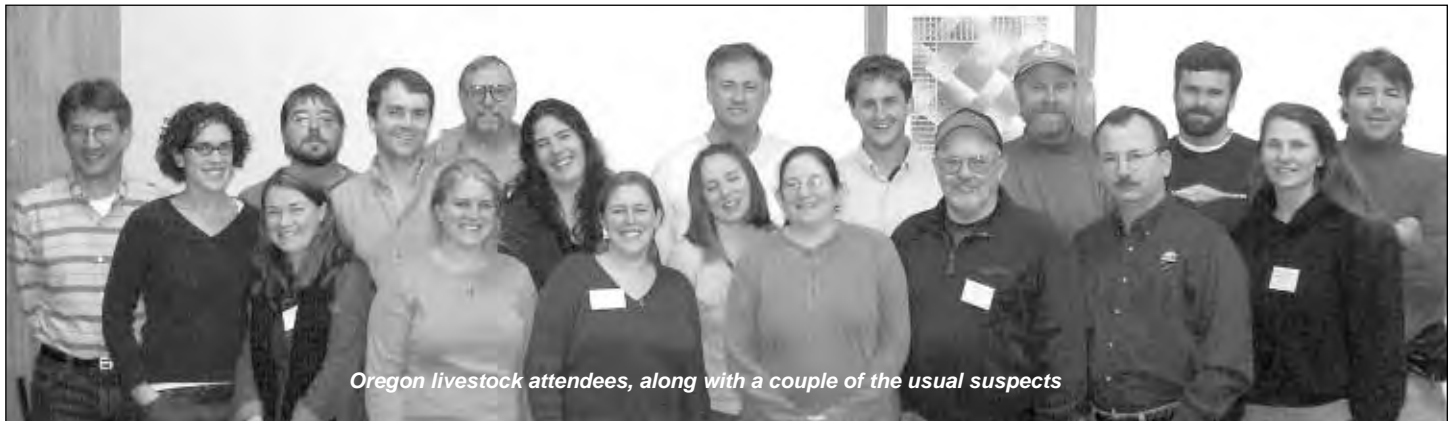
Oregon livestock attendees, along with a couple of the usual suspects