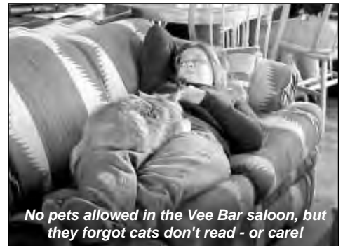
No pets allowed in the Vee Bar saloon, but they forgot cats don't read - or care!