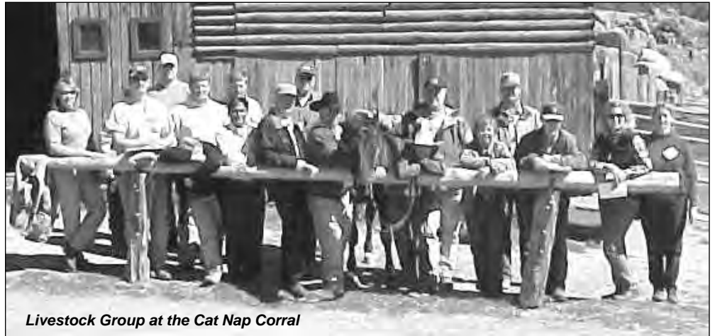
Livestock Group at the Cat Nap Corral